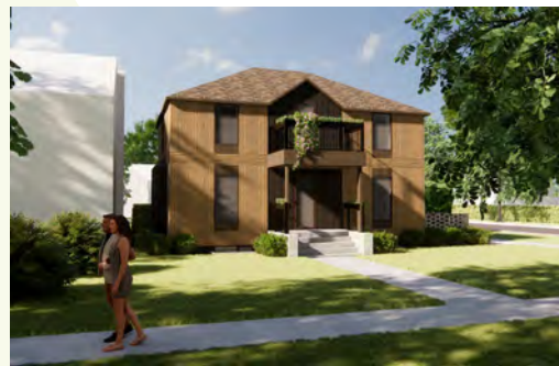
3 A 59 Banerhman Deep Retrofit & Addition as seen from Banerhman Avenue.