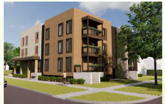
4 A 64 Banerhman New Building as seen from the corner of Banerhman Avenue & St. Cross Street.