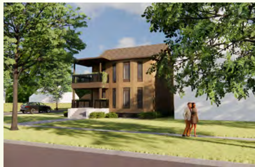
2 A 143 Machray Deep Retrofit & Addition as seen from Machray Avenue.