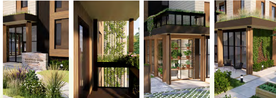
Community oriented, biophilic design elements incorporated into the building design: 1) Reclaimed brick signage, 2) generous balconies, 3) greenhouse options, 4) integrated social spaces.

We are proposing to develop a scattered housing co-op in North Winnipeg with a total of 26 units - a central new building with 12 units on land owned by the co-op and two nearby clusters of 6 units each. 40% of the suites will be Affordable and 100% of suites will be fully visitable AND fully accessible. All suites will be zero carbon, net-zero energy with PassiveHouse, Living Building Challenge and Zero Carbon Building certifications. There will be no gas supplied to any of the sites and we anticipate net-zero feed-in for electricity.